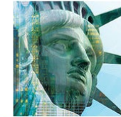
Civics, Economics, and Geography - Florida Edition 2018