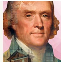
Discovering Our Past: A History of the United States, Early Years - Florida Edition 2018