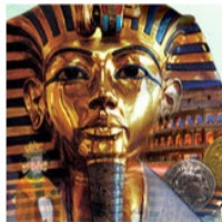
Discovering Our Past: A History of the World, Early Ages - Florida Edition 2018